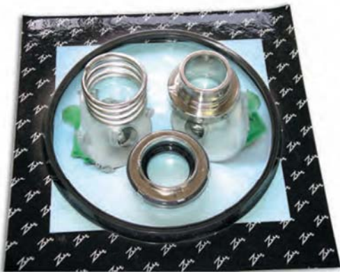
Tri-Clover Seal Kit

Tri-Clover® Pumps – For pump models: C, SP and EH series. ZMT offers lower cost alternatives to genuine Tri-Clover® seals, and Tri-Clover® pump replicas. ZMT offers more choices than O.E.M.: Carbon vs. Sil-Car and Sil Car vs. Sil Car seals. We also offer ZMT engineered seals. These seals provide superior performance and better reliability by eliminating back-plate wear. These are pre-assembled cartridge seals. ZMT maintains strict quality standards to ensure our Tri-Clover® seals meet or exceed O.E.M. specifications.